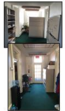
Office cubicles at end of hallways, and inefficient 12 ft ceilings and 8-ft wide corridors