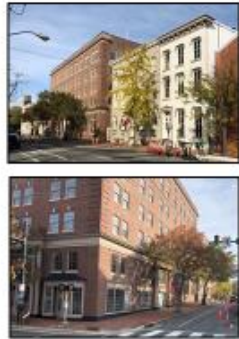
Hotel at 699 Prince Street and apartments at 605 Prince Street