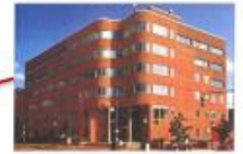
1420 King – NSPE Built 1984