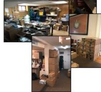
Inadequate functional space for logistics, staging, shipping and storage for events