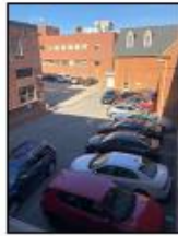
27 people, double parking required. Parking in background goes away with construction