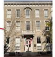
607 Prince Built 1850