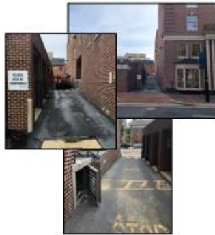
Entrance and exit single-lane alleyway to parking behind Century House; vehicle blocking lane